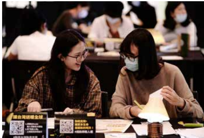
273784 Amnesty Taiwan Letter Writing event, December 2020