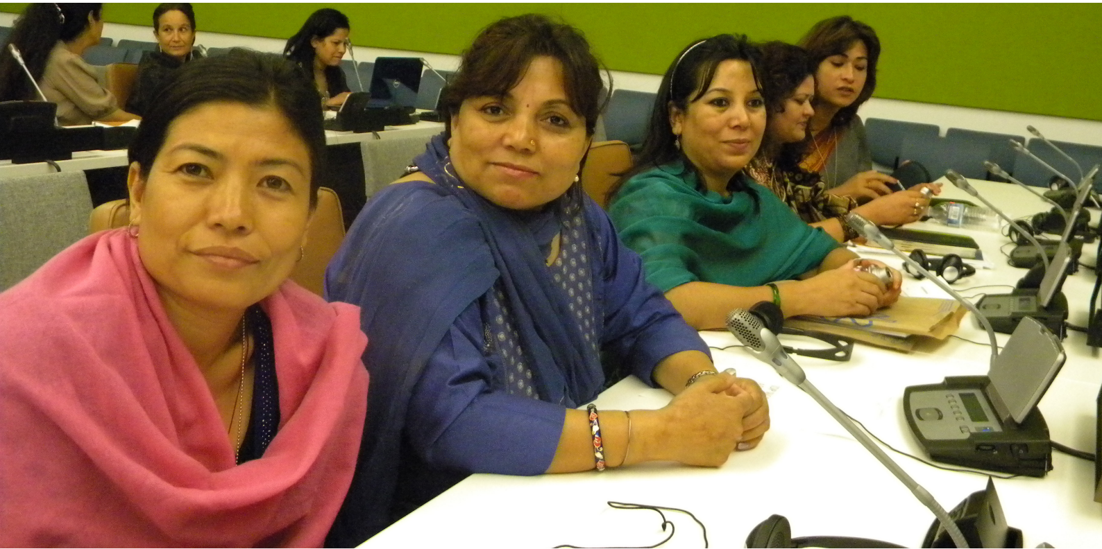
Members of the Nepal Indigenous Women's Federation (NIWF) at the 49th Session of the Committee on the Elimination of Discrimination Against Women (CEDAW) in July 2012 in New York.