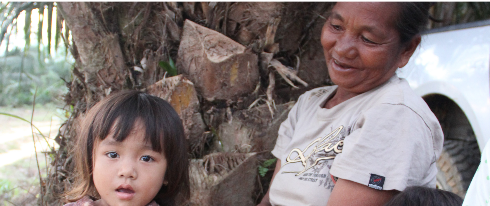
Indigenous Batin Sembilan woman and her children from SAD 113 village, PT Asiatic Persada oil palm concession, Jambi, Sumatra, Indonesia.