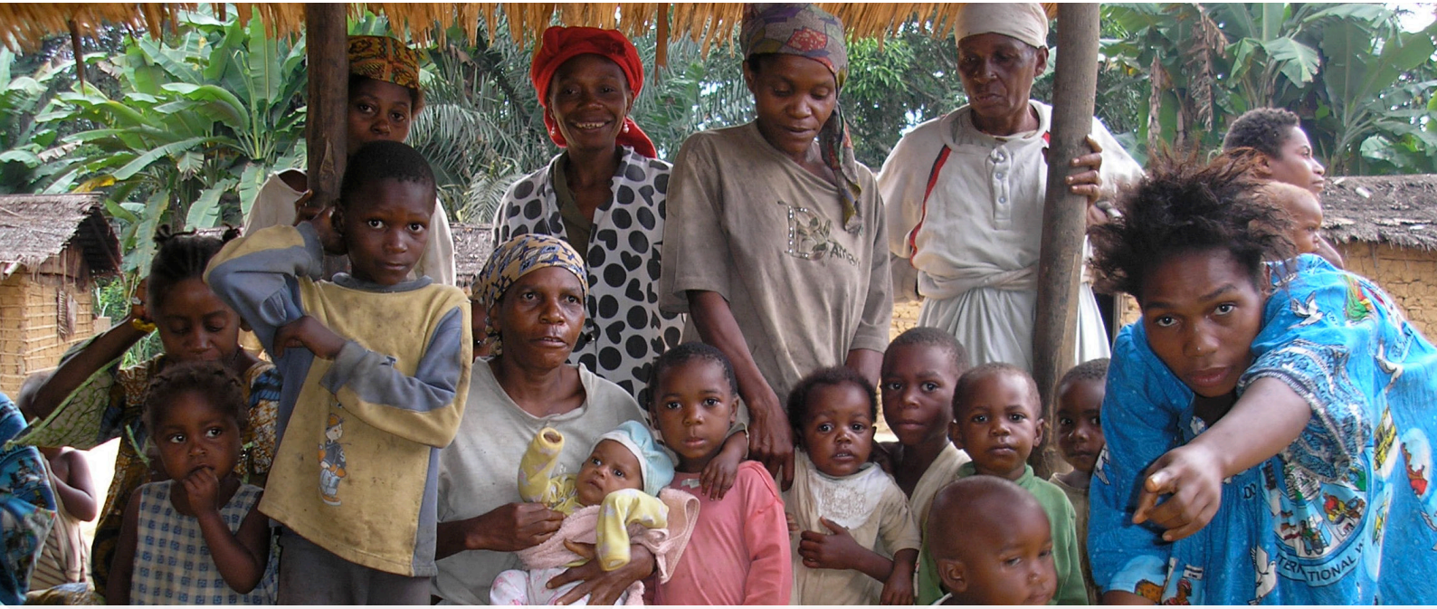
Baka women and their children at a community meeting in Cameroon.