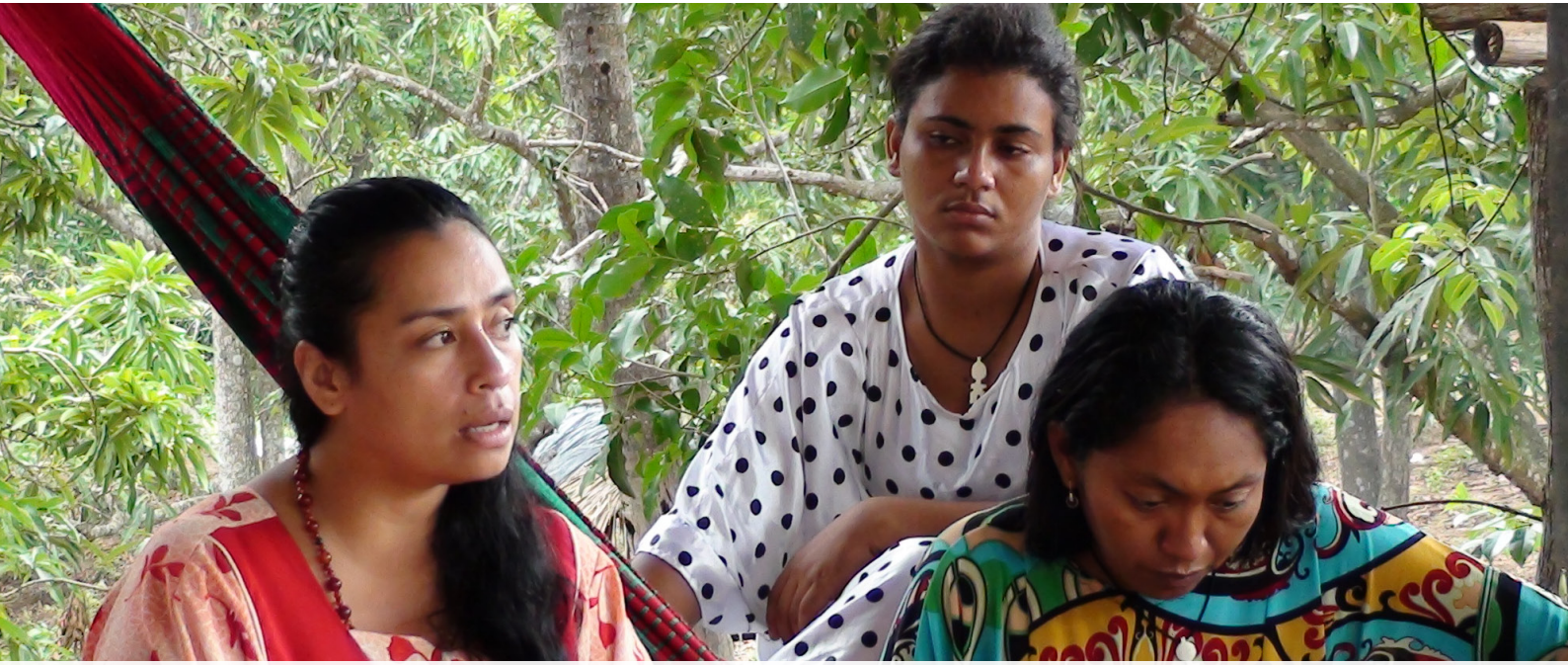
Wayuu women in Colombia.