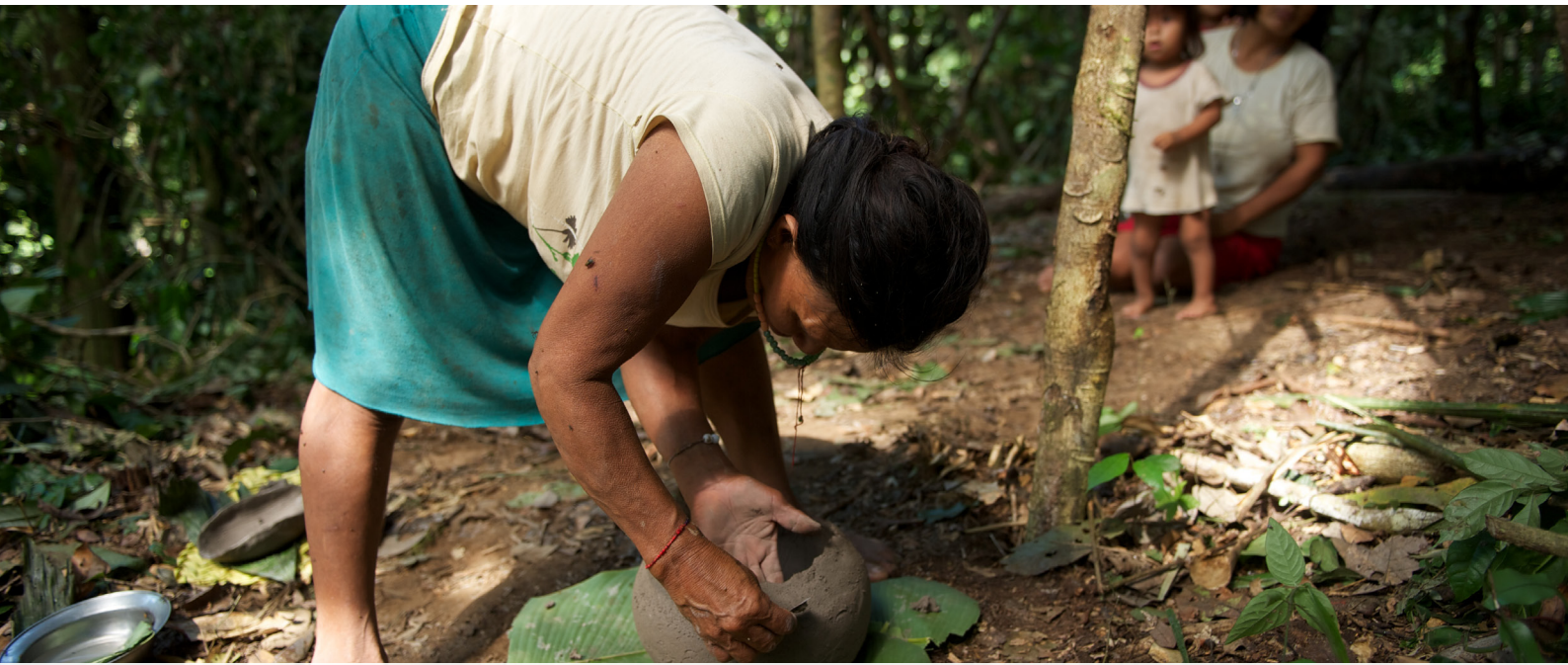
Nahua women in their ancestral territory, South East Peru.

We, the women of the original peoples of the world, have struggled actively to defend our rights to self-determination and to our territories which have been invaded and colonised by powerful nations and interests. We have been and are continuing to suffer from multiple oppression; as indigenous peoples, as citizens of colonised and neo-colonial countries, as women, and as members of the poorer classes of society. (...)