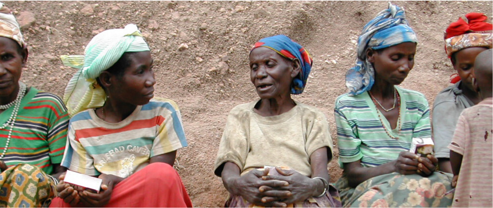
Indigenous women in Rwanda.